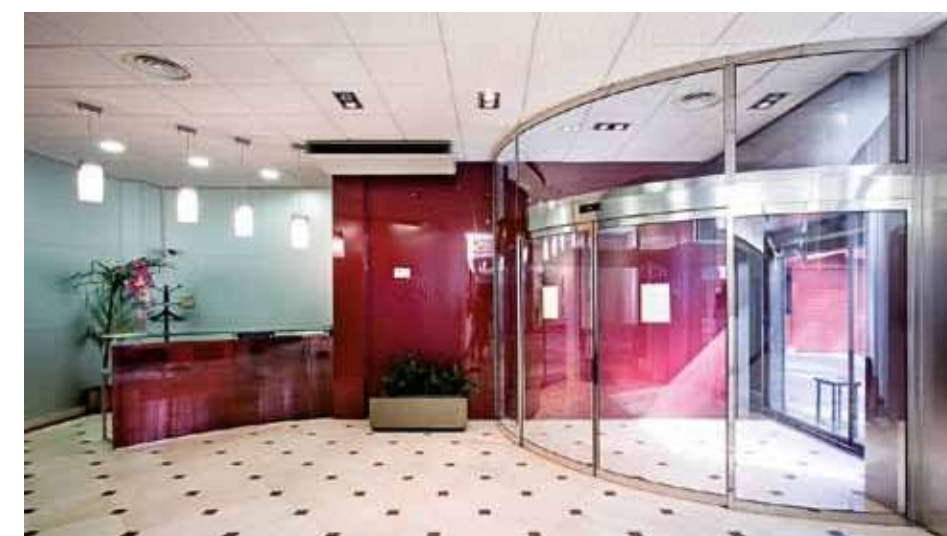
Curved automatic door. Corporate building.