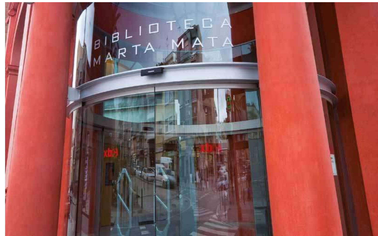
Circular automatic door. Library.