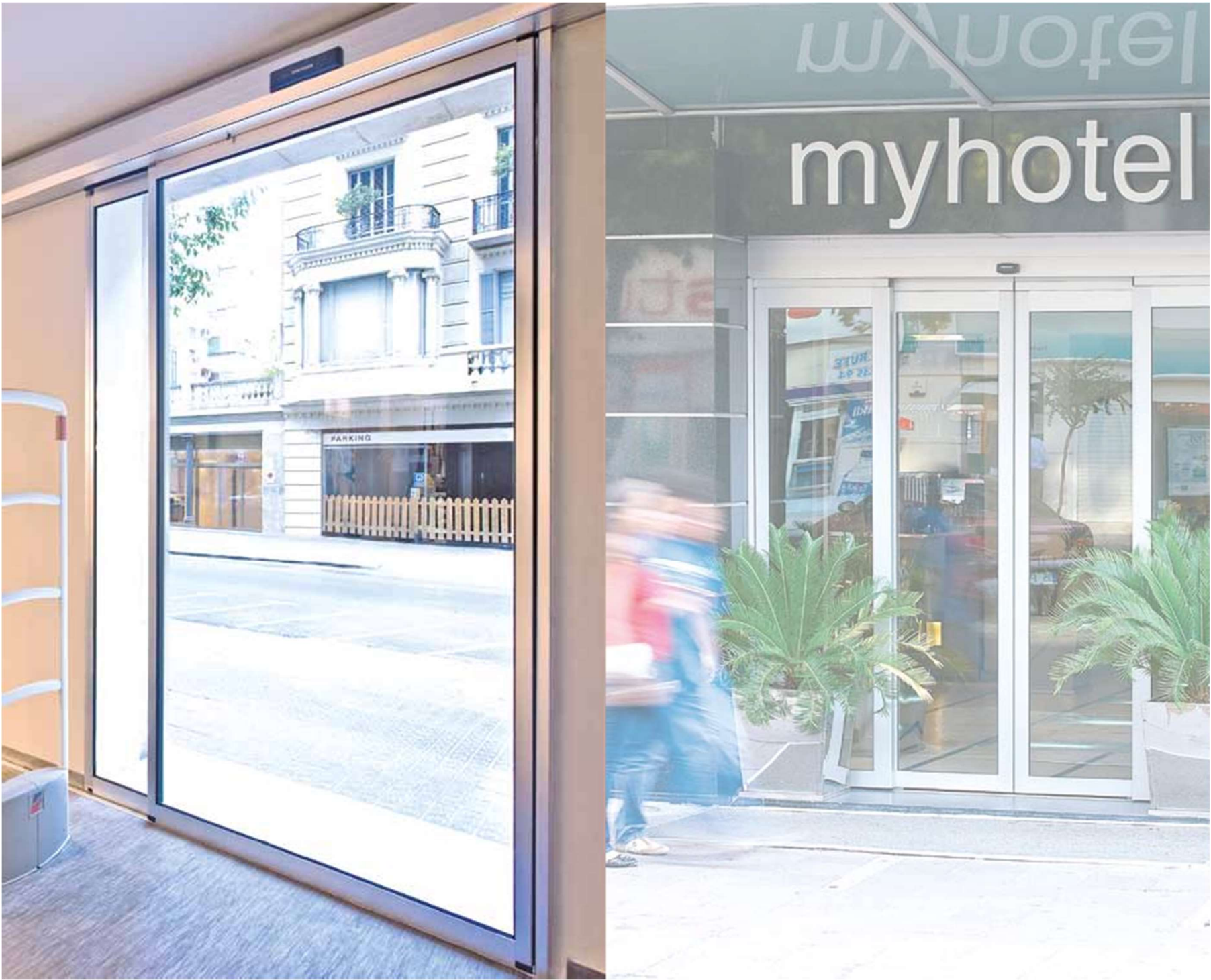
Single sliding door with framed leaf. Retail sector.