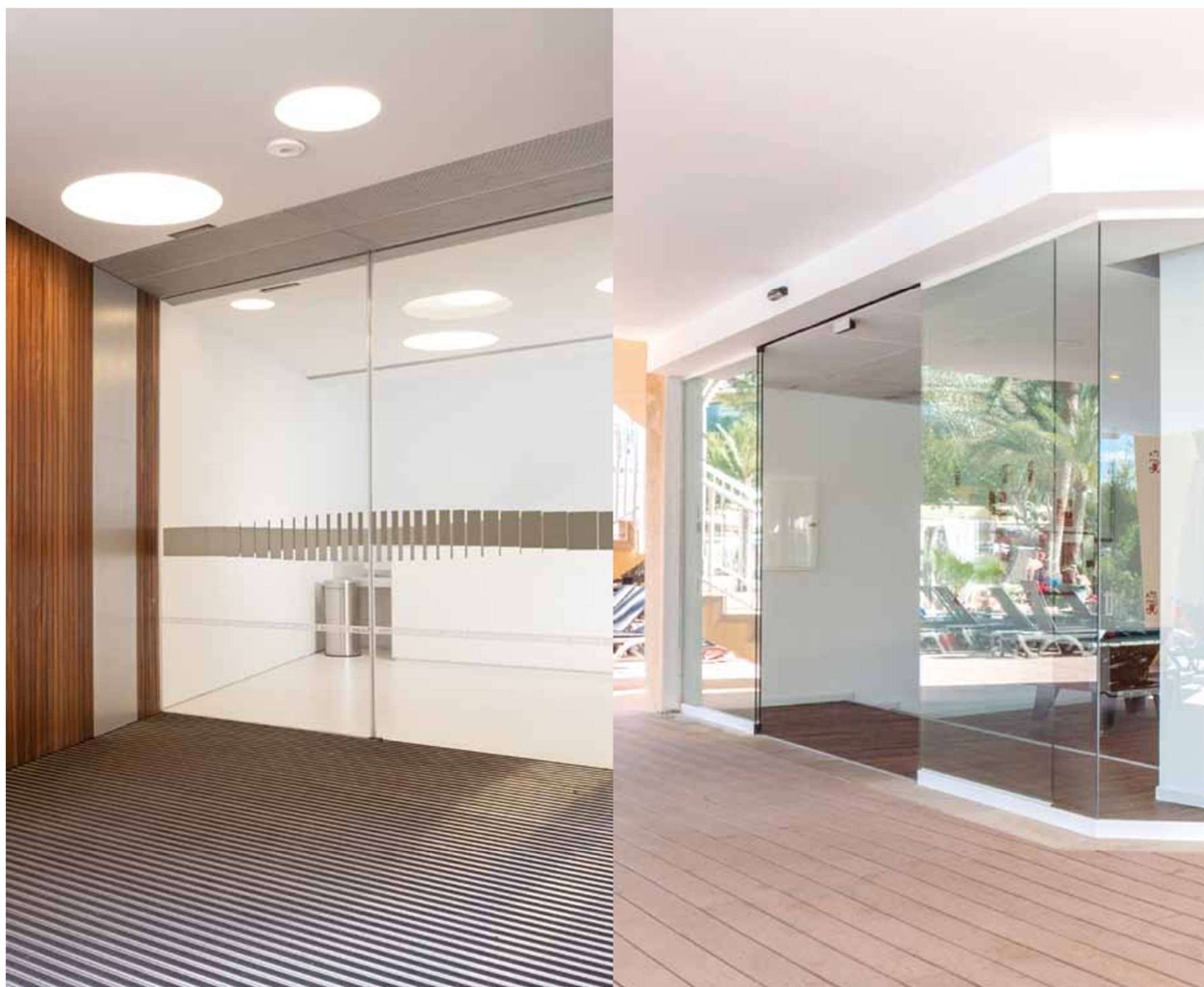
Single sliding door with total transparent leaves, option of hidden rail. Museum sector.