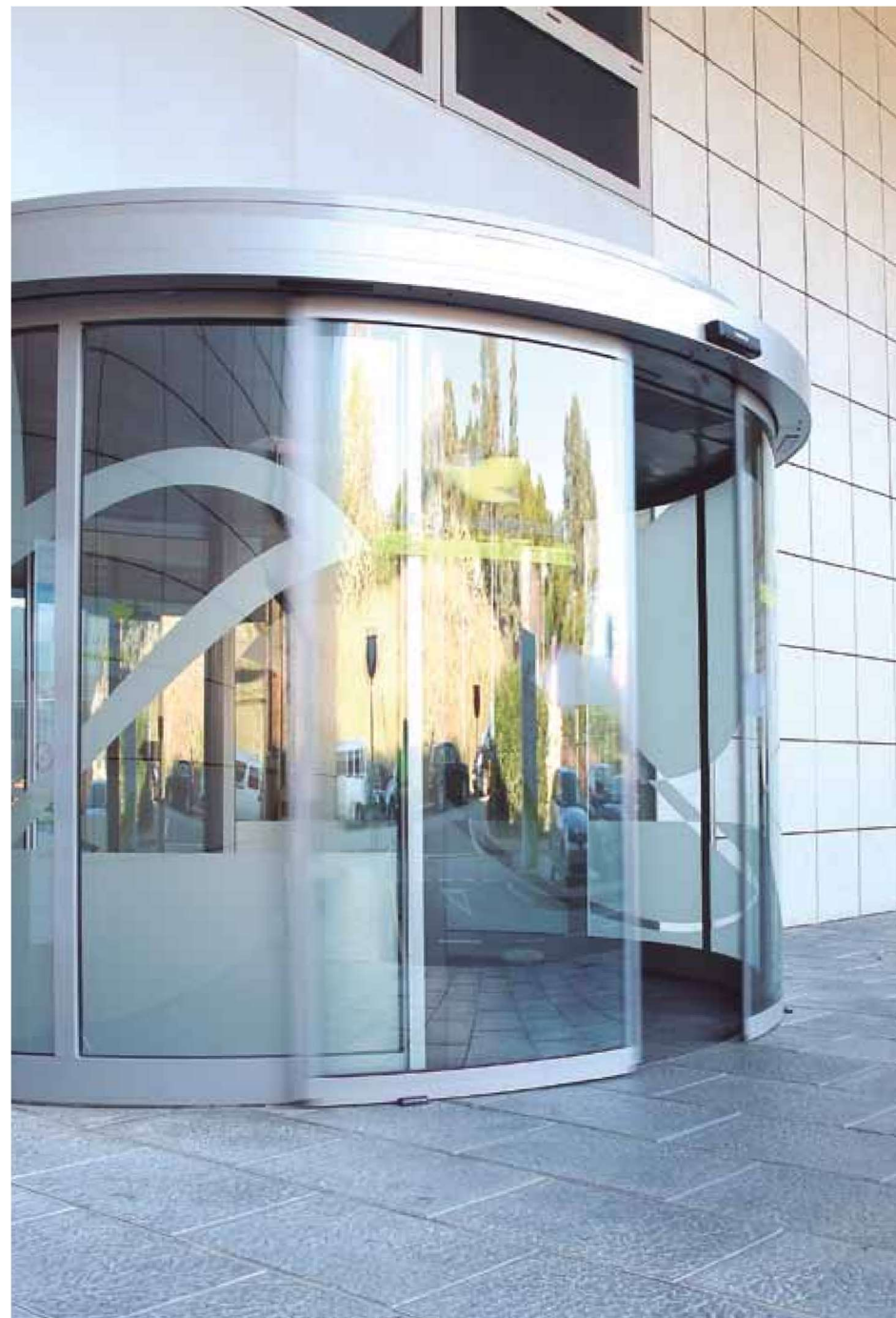
Circular automatic door. Hospital.

The door may be concave or convex and with different radius and degrees of curvature. The combination of two curved doors creates circular doors, ideal for entrances that are both exceptional and functional at the same time.