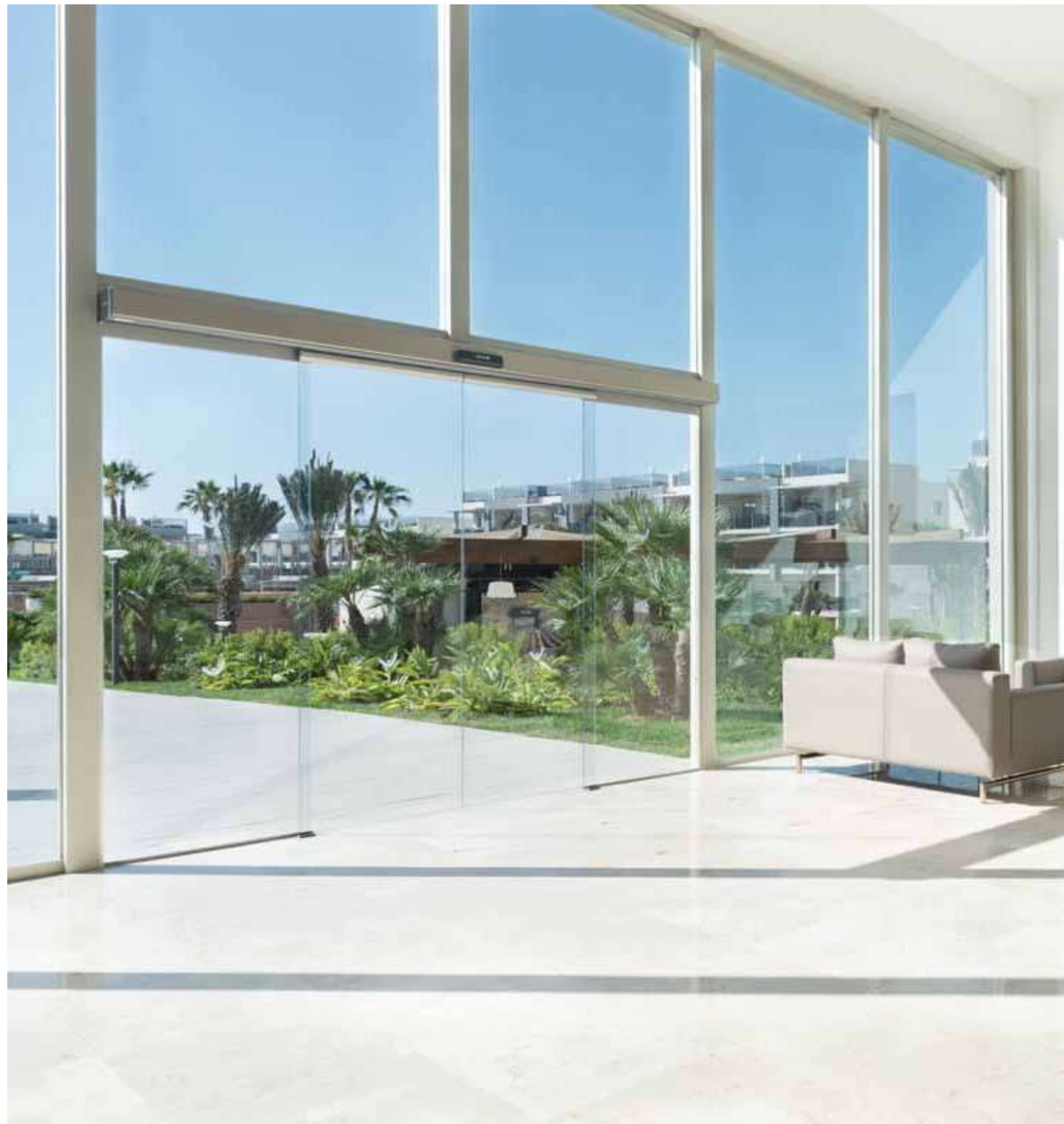
Bi-parting sliding door. Hotel sector.

Manusa bi-parting and single sliding doors offer the highest opening speed on the market, together with maximum safety. They are recommended for high traffic public entrances and exits or where user safety is linked to the fluidity of the traffic.