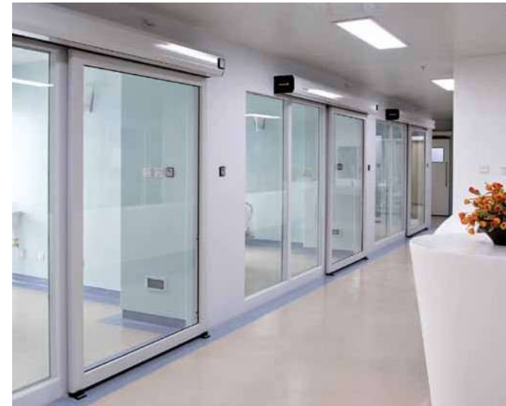
Clear View glass hermetic doors. Hospital ICU room.