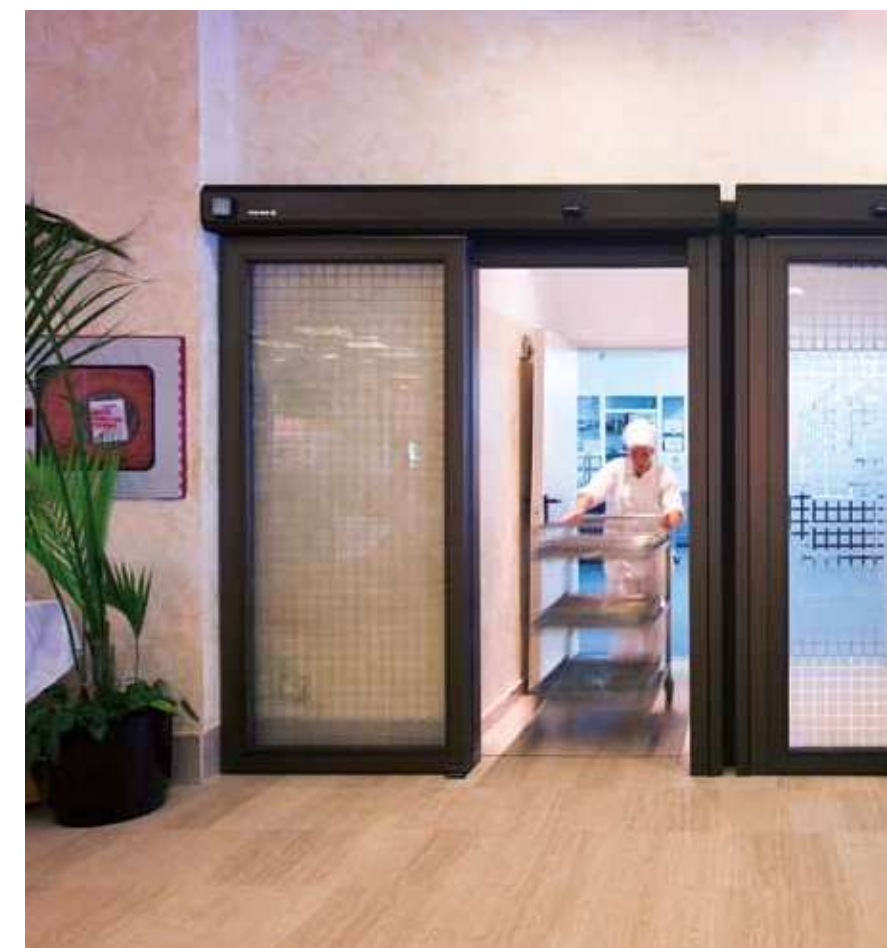
Fire-resistant door separating kitchen and restaurant. Hotel sector.

Manusa's fire-resistant door consists of a bi-parting or single sliding automatic door with fire-resistant properties.