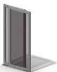
45 mm frame

Applicable to bi-parting and single automatic sliding doors.