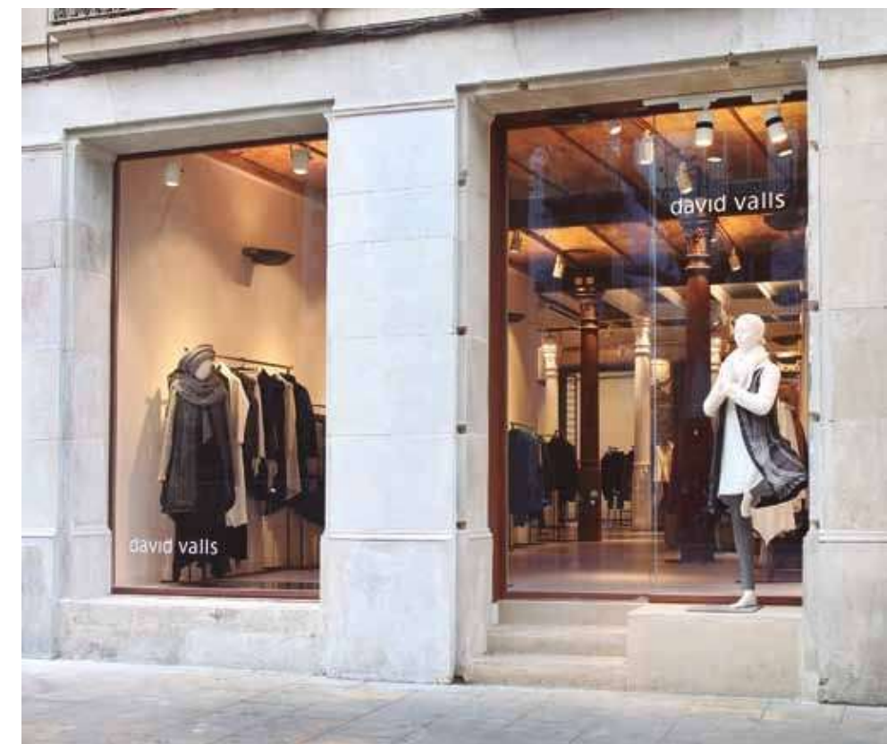
Single sliding door. Retail sector.