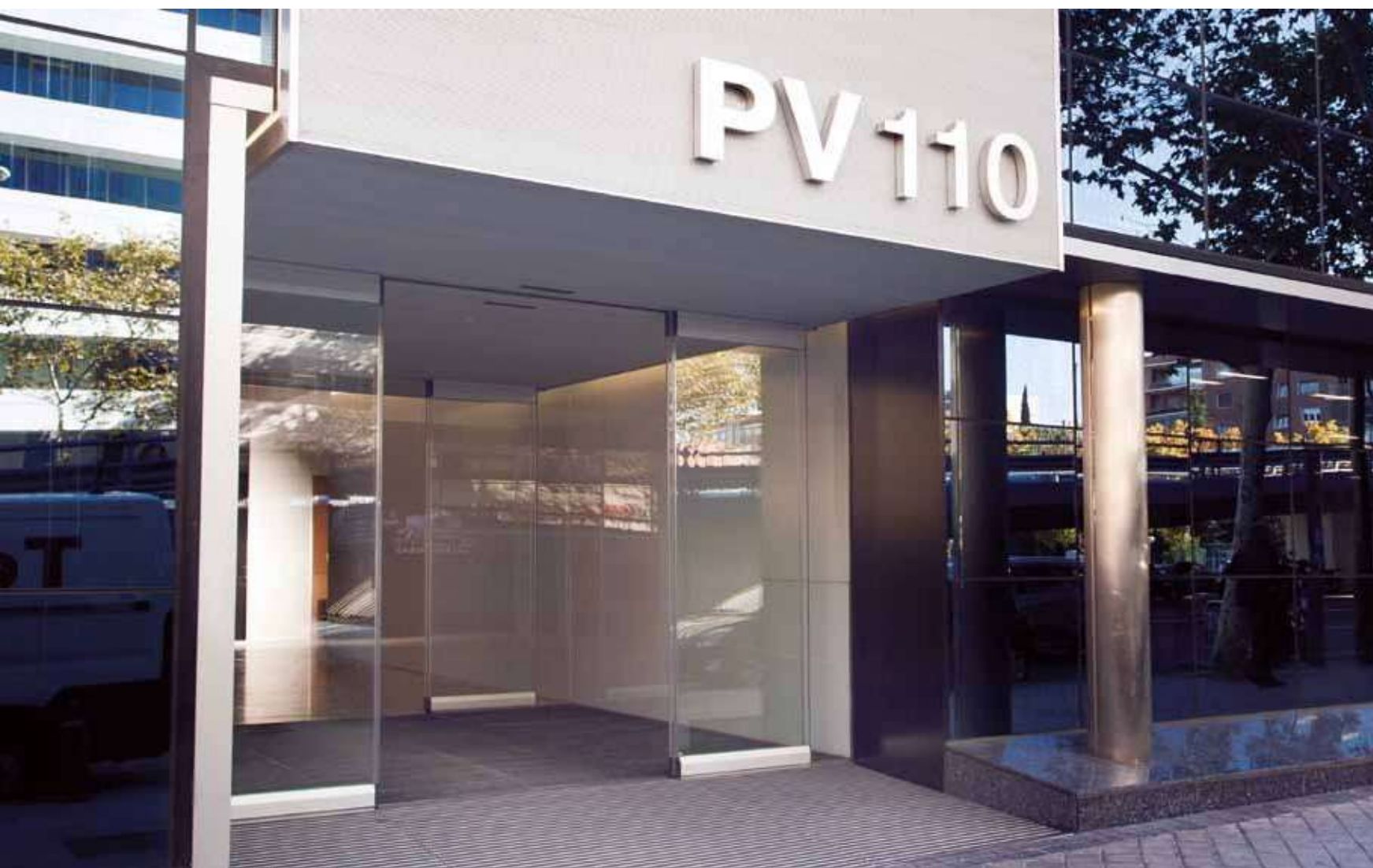
Panic break-out door without vertical stiles. Office building.

The automatic doors with Manusa's panic break-out mechanism combine the features of a sliding door with the safety of break-out leaves, thus maximising the opening.