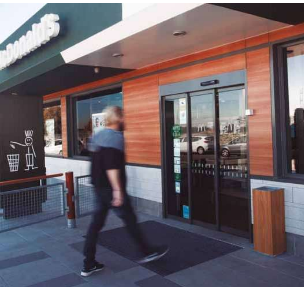
Telescopic sliding door. Restaurant sector.

Single slide telescopic doors: Sliding door with 2 sliding leaves that move to one side. The sliding leaves retract one behind the other to leave the maximum possible opening at one side of the door.