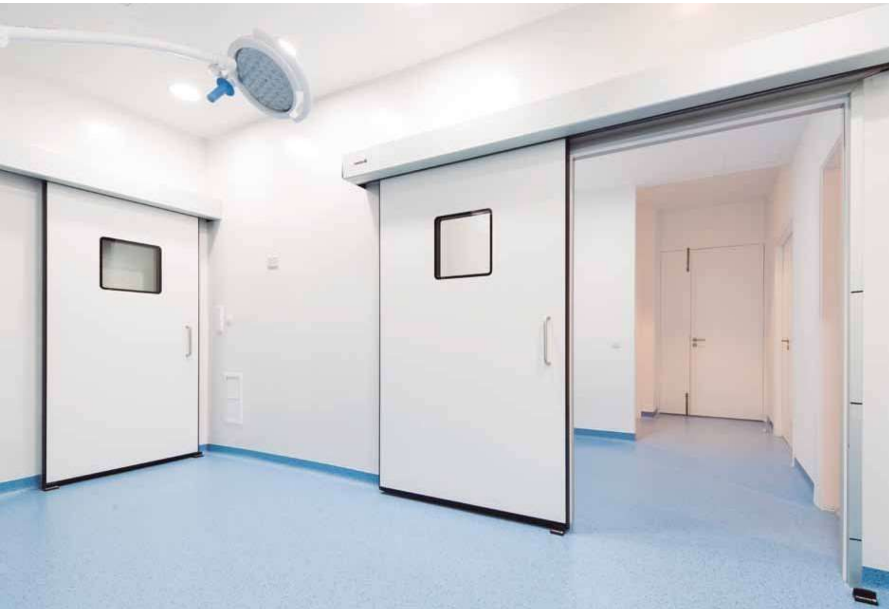
Hermetic sliding doors. Hospital operating theatres.

Manusa's hermetic doors unite the advantages of an automatic door with the seal and hygiene required in clean room environments.