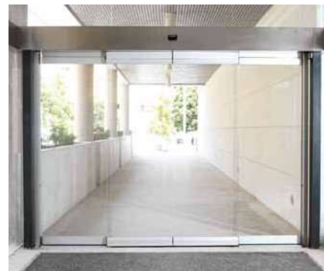
Panic break-out door without vertical stiles. Shopping centre.

The door functions in normal mode (sliding and automatic). In an emergency, the leaves can be pushed outwards by hand, and automatically retract to the sides to create a large opening for evacuation.