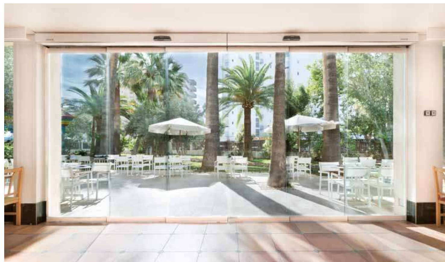
Telescopic sliding door. Hotel sector.