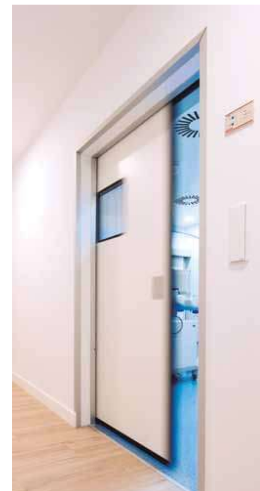
Hermetic sliding doors. Hospital operating theatres.

The whole door assembly is designed to guarantee hygiene: recessed vision panel, door handle, easy cleaning materials.